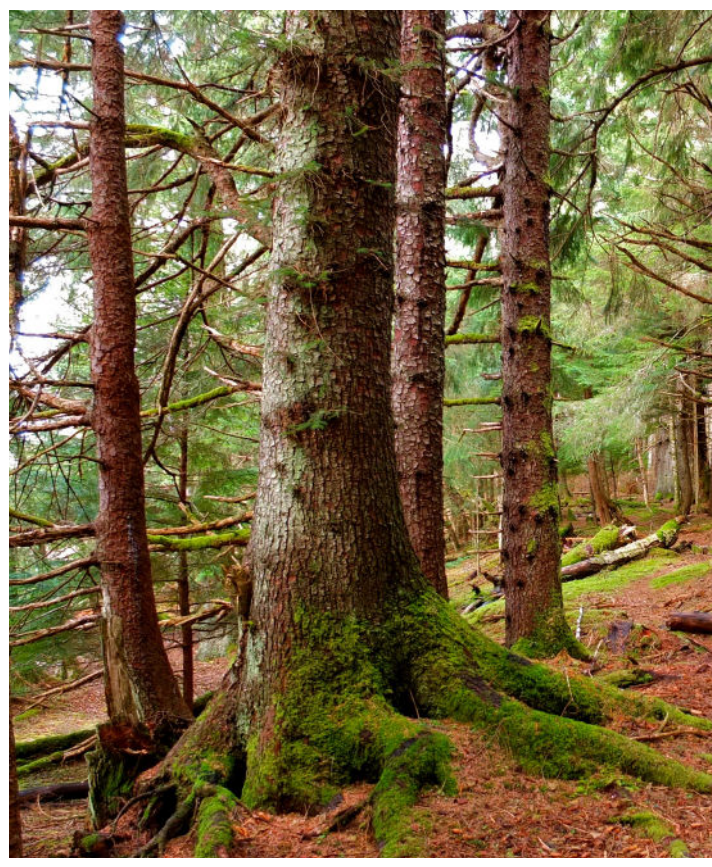
Tongass trees.

"salvage" timber—timber that is dead, damaged, downed by other natural means, or otherwise in need of clearing—and uses its funds to prepare and administer future salvage sales.