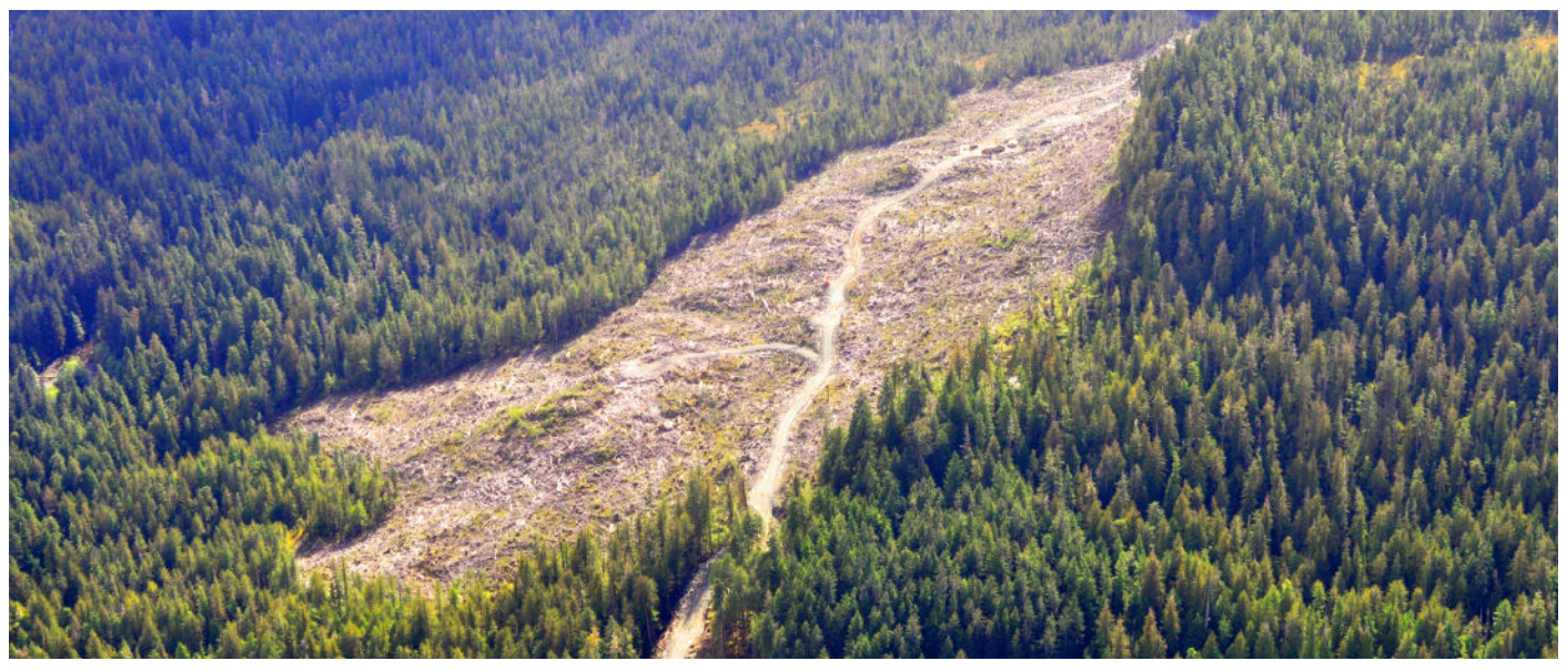
Clearcut timber harvest in the Tongass National Forest on Prince of Wales Island, AK. Photo used with permission.

The U.S. Forest Service (USFS) within the Department of Agriculture manages 193 million acres of public forests and grasslands collectively known as the National Forest System. The Tongass National Forest (Tongass) in southeast Alaska is the largest national forest at 16.8 million acres, roughly the size of West Virginia. Every year, the USFS prepares and conducts sales for the rights to harvest millions of board feet of timber from the Tongass. These sales have historically generated less revenue than the USFS spends to administer them, resulting in large net losses for U.S. taxpayers. New budget data reveal that the USFS has continued to lose millions of dollars on Tongass timber sales in recent years.