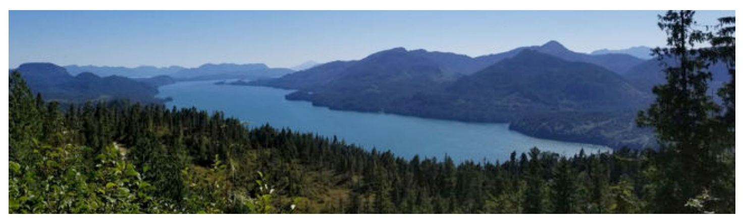
Carroll Inlet in the Tongass National Forest.

In 1988, the GAO reported that USFS timber sales had lost $22.1 million in FY1986,<sup>4</sup> roughly equivalent to $50.6 million in 2018 dollars. As its most recent estimate, the GAO reported in 2016 that Tongass timber sales had lost $11.4 million per year on average during the period FY2005-2014. The agency was careful to note, however, that its estimate excluded USFS roadbuilding costs.<sup>5</sup>