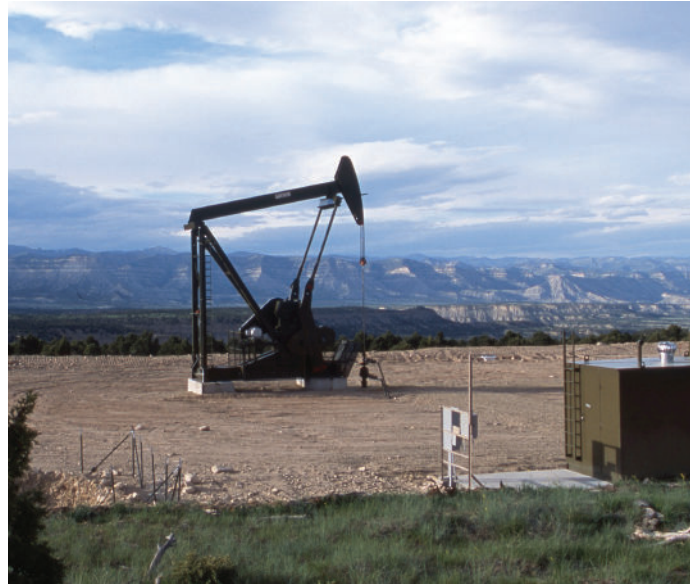
Oil and Gas Rig.

During the lease sale private companies bid against one another for the right to lease each parcel. The company with the highest bid wins the lease. This is a one-time payment and provides the private company with the exclusive rights to develop oil and gas on the parcel of federal land for a period of ten years.