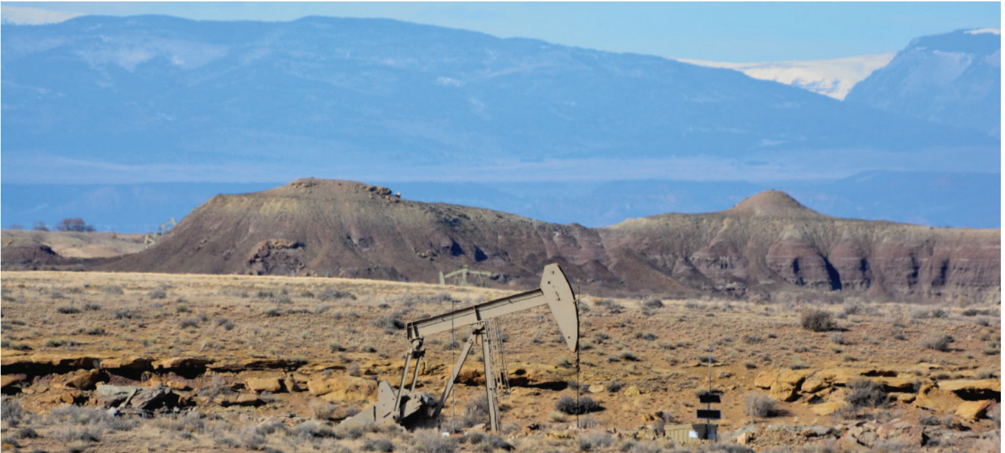
Oil and Gas Rig.

emissions of methane—a potent greenhouse gas—will also create additional liabilities for taxpayers.