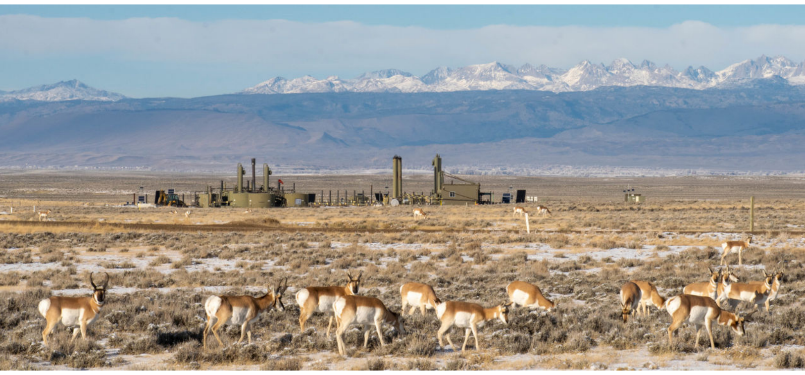
Used with permission.

on roughly 62% of available acres. In Wyoming, producers bid on 87%, suggesting high industry interest in the lucrative Wyoming basins. Yet bidding amounts were consistently low. In comparison to other high-producing states like New Mexico and North Dakota, where bids averaged roughly $3,970 per acre and $1,570 per acre respectively, the average bidding rate for Wyoming acres since 2010 was just $160. In 2019, companies bid just $120 per acre on average.