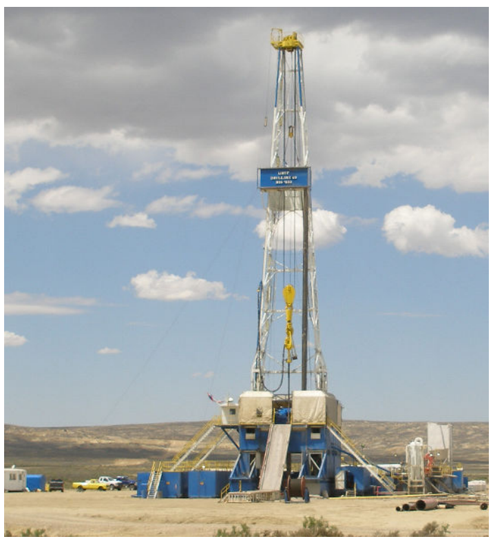
Used with permission.

By the end of July, the BLM had awarded relief to 375 leases covering 211,000 acres in Wyoming, representing more than 70 percent of all leases granted relief nationwide. Unlike other states, where BLM reduced royalty rates to varying levels, every single lease granted relief in Wyoming had their rate reduced to just 0.5 percent, a 96 percent reduction from the statutory minimum rate. In August, Department