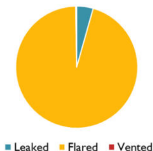
Lost Natural Gas by Source

In 2019, fossil fuel producers wasted 226 billion cubic feet of gas in total: 95% by flaring; 4% by leaking; and <1% by venting.